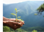
News & Events

The course will be open for participation for anyone with a basic environmental sustainability, electronic, electrical, computer or mechanical technical background